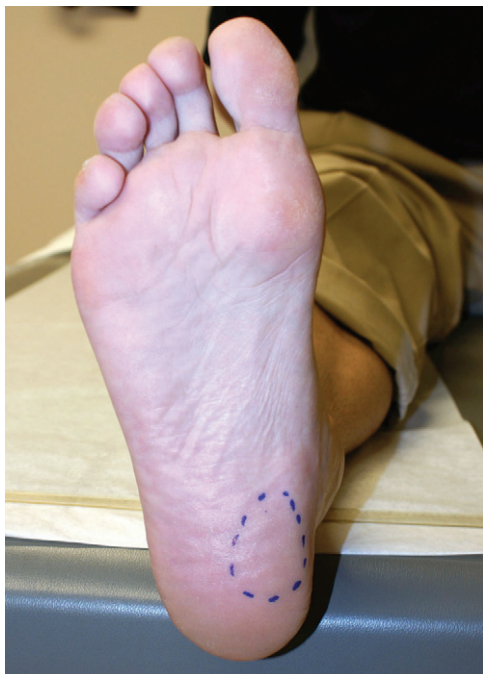
Figure 1. Medial plantar region of the heel where most pain is elicited when pressure is applied during physical examination or with walking in patients with plantar fasciitis.

initially, imaging can be used to confirm recalcitrant plantar fasciitis or to rule out other heel pathology.