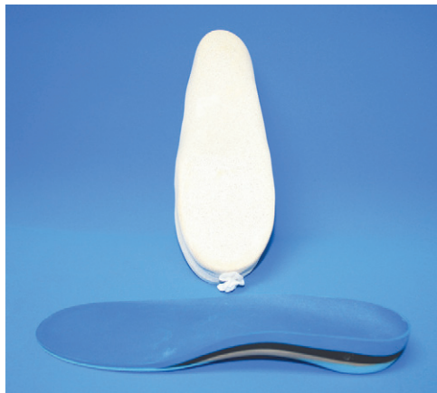
Figure 7. Over-the-counter heel ( top ) and arch ( bottom ) orthotics.