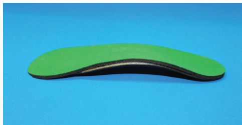
Figure 8. Custom-made foot orthotic.

A prospective randomized study of 100 persons with plantar fasciitis compared a variety of treatments, including autologous blood injection, lidocaine (Xylocaine) needling, triamcinolone (Kenalog) injection, and triamcinolone needling, and found superior results in both triamcinolone groups. 14 Possible risks associated with corticosteroid injection include fat pad atrophy and plantar fascia rupture.