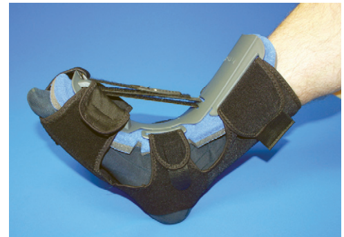
Figure 9. Anterior night splint.

In recent years, other injectable options have been used to treat plantar fasciitis. Even without the use of therapeutic medications, percutaneous fenestration (dry needling) has been shown to reduce pain in as early as four weeks. 15 Hyperosmolar dextrose (prolotherapy), whole blood, platelet-rich plasma, and onabotulinumtoxinA (Botox) are being investigated as treatment options. In a pilot study, a 25% dextrose/lidocaine solution was shown to improve plantar fasciitis pain in 20 persons. 16 Intralesional whole blood injections do not appear to be as effective as corticosteroid injections in treating plantar fasciitis. 14,17 Platelet-rich plasma is produced via centrifuged autologous blood.