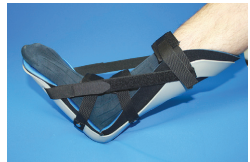
Figure 10. Posterior night splint.