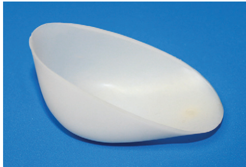
Figure 6. Over-the-counter heel cup.