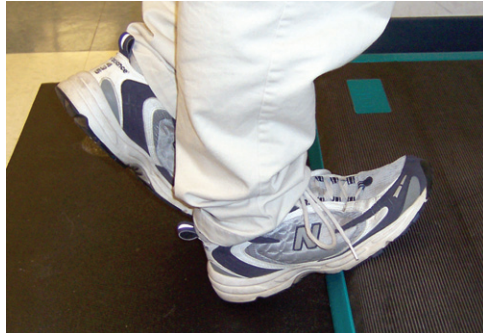
Figure 5. Eccentric stretch used for plantar fasciitis.