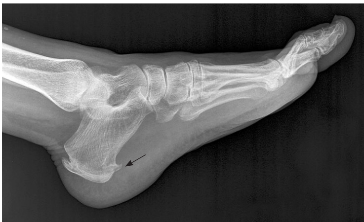
Figure 2. Lateral radiography of the foot showing a large heel spur (arrow).

living. Although several remedies exist for plantar fasciitis, there is little convincing evidence to support these various treatments. Conservative treatments usually start with patient-directed therapies and advance to physician-prescribed modalities based on how a patient's symptoms respond over weeks to months ( Figure 4 ). 2 Within this time, 90 percent of patients will improve with conservative therapies. 2,5 If a patient's symptoms persist six months or longer, further invasive procedures are sometimes required.